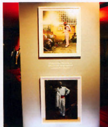
Jackie Nickerson photographic exhibit