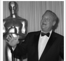
Room for Debate: Why Comedies Get No Respect