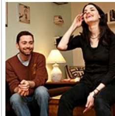
Trading the Nest, for a Place for Two