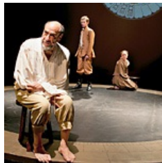
A Man of Science, a Man of Silence