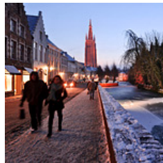
36 Hours: Bruges, Belgium